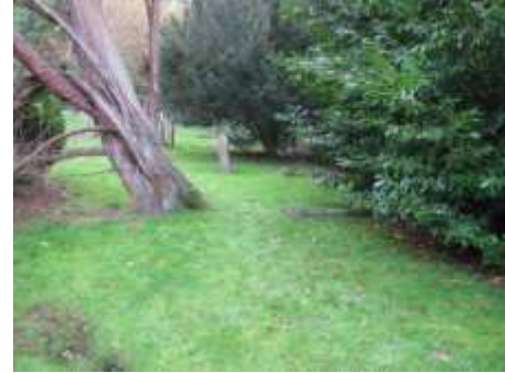
Southern part of the section