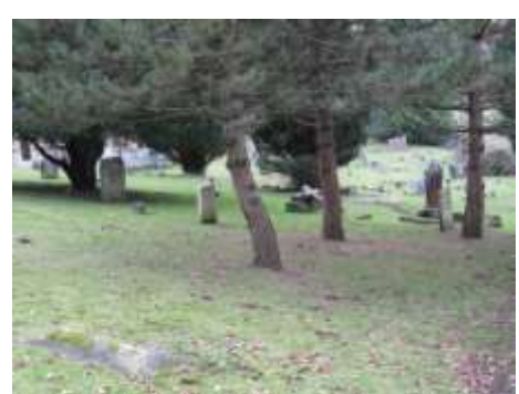
Lower part of the section