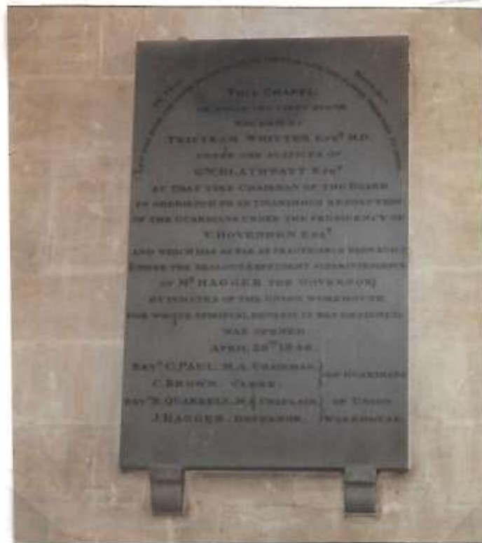
2. Memorial stone recording the opening on April 28th 1846.

Texts. Psalm 74. v.21 Let the poor and needy praise thy Name.