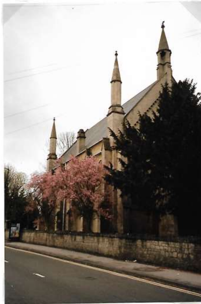
1. The Chapel of St Martin's Hospital, Frome Road, Bath. April 1996.