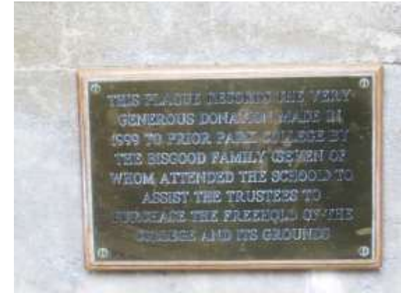
THIS PLAQUE RECORDS THE VERY GENEROUS DONATION MADE IN 1999 TO PRIOR PARK COLLEGE BY THE BISGOOD FAMILY (SEVEN OF WHOM ATTENDED THE SCHOOL) TO ASSIST THE TRUSTEES TO PURCHASE THE FREEHOLD OF THE COLLEGE AND ITS GROUNDS.

. . . DOMINE ET OMNIBUS IN CHRISTO Q. . . . . LOCUM REFRIGERII LUCIS ET UT INDULGEAS DEPRECAMUR