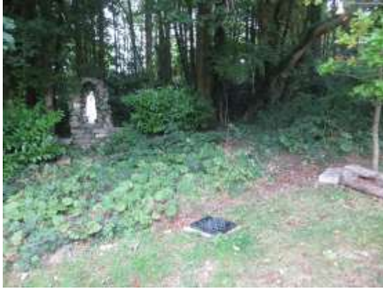
By a grotto in the college's grounds are two burials of ashes.