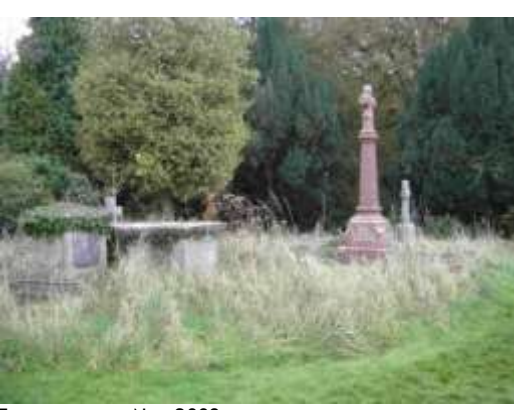
Eastern rows -Nov 2008

Section 2 is to the east of the tower, north of Section 1. It has only a couple of dozen graves. The area is crossed by three paths.