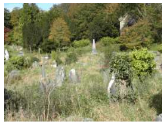
Looking towards the north-western corner