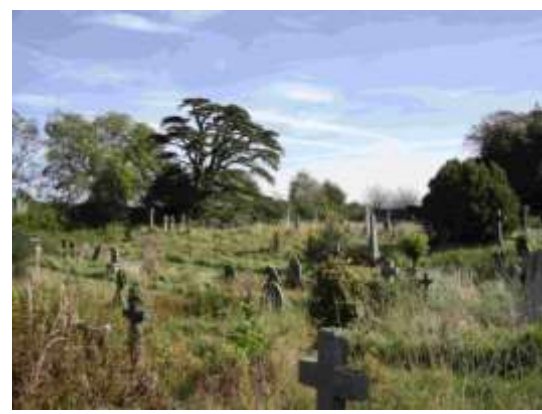
From the north-western corner, looking south-east

Section 4 is the largest in the cemetery with about 1000 graves. It is in two sections. The western section is a sunken area which is reached from the west from paths that lead down from section 5 and from the north by a single path. The eastern section is at the same level as sections 6 and 7.