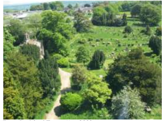
From Beckford Tower May 2009