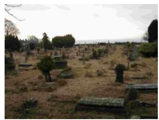
Western section - Jan 2009