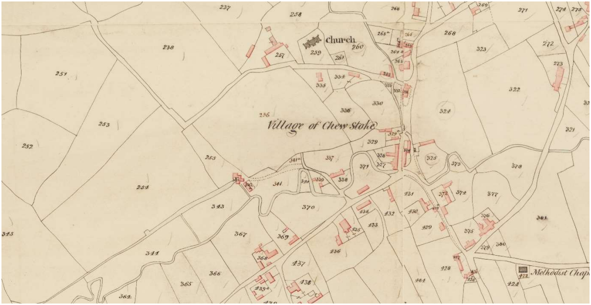
Part of the tithe apportionment map for Chew Stoke

The maps were drawn up mostly between 1838 and 1850, and they are 'one-offs', although occasionally they were copies of estate maps where the parish was wholly part of an estate, such as Bathwick. They are not like Ordnance survey maps where there are editions for different dates, and they were all drawn to different scales and with different degrees of accuracy. Each piece of land on the tithe map is numbered, with a corresponding number on the Apportionment. The land belonging to exempt persons – such as the vicar or lord of the manor – were unnumbered.